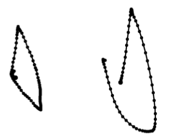
(a) with feedback (b) without feedback Figure 1. Examples of gestures (diamond shape) produced with and without visual feedback by one participant (a child, to scale).

In this paper, we extend previously presented results from an empirical study conducted with 41 children, teens, and adults to explore characteristics of gesture interaction with and without visual feedback (Anthony, Brown, Nias, & Tate, 2013). We asked questions such as: How well are children, teens, and adults able to enter surface gestures with and without visual feedback? Does presence or absence of visual feedback affect consistency of the gestures made? If so, is automatic gesture recognition impacted by these changes in consistency? Which mode of gesture input (with or without feedback) do adults, teens, and children prefer?