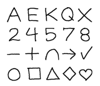
Figure 2. The set of 20 gesture types used in our study, which we borrow from prior work on gesture interaction for kids (Anthony et al., 2012).

crucial for gesture interaction design for children than for adults since children are still developing the sensorimotor coordination ability required to draw without looking.